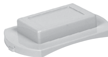
Removable lens cover supplied